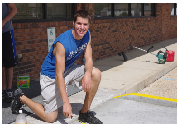
Parking lot maintenance was just part of the work done on 9-11-11.