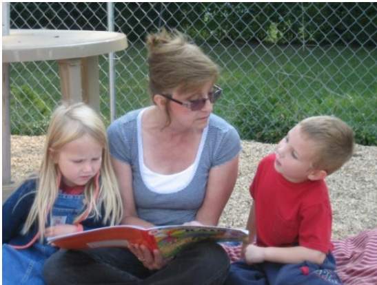
Quality childcare provides long-lasting benefits for children's learning and behavior

One of the opportunities we had this year was to share information with caregivers on the importance of oral health care for children. We were not sure if any of the programs would be willing to add tooth brushing to their already busy daily routine, but we could see there was a need. When we provided training we discovered the barrier to providing tooth brushing was the equipment needed to safely offer this service in group care. We used Accreditation funding to purchase the needed materials and ten of the Accreditation programs are now brushing teeth with the children. One of the participants in the Accreditation program said, "All the help with accreditation is helping me feel more comfortable and more confident in myself. I feel so much closer to being accredited after this past year."