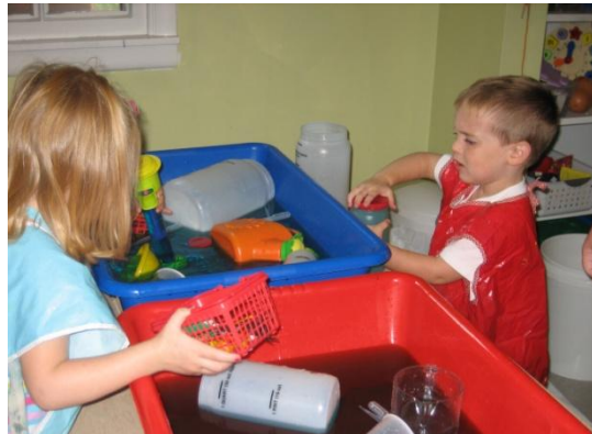
Children in quality care are better prepared to enter school ready to learn.

We are happy to have a successful new program for children. A participant in the Start Up and Expansion program said; "What was most helpful about working with the ECE staff was the availability of support, not just the funding. You were available when I needed ideas on where to go next or figuring out what I could do."